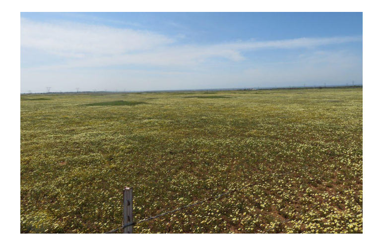
Millville Plains a few miles east of proposed site.